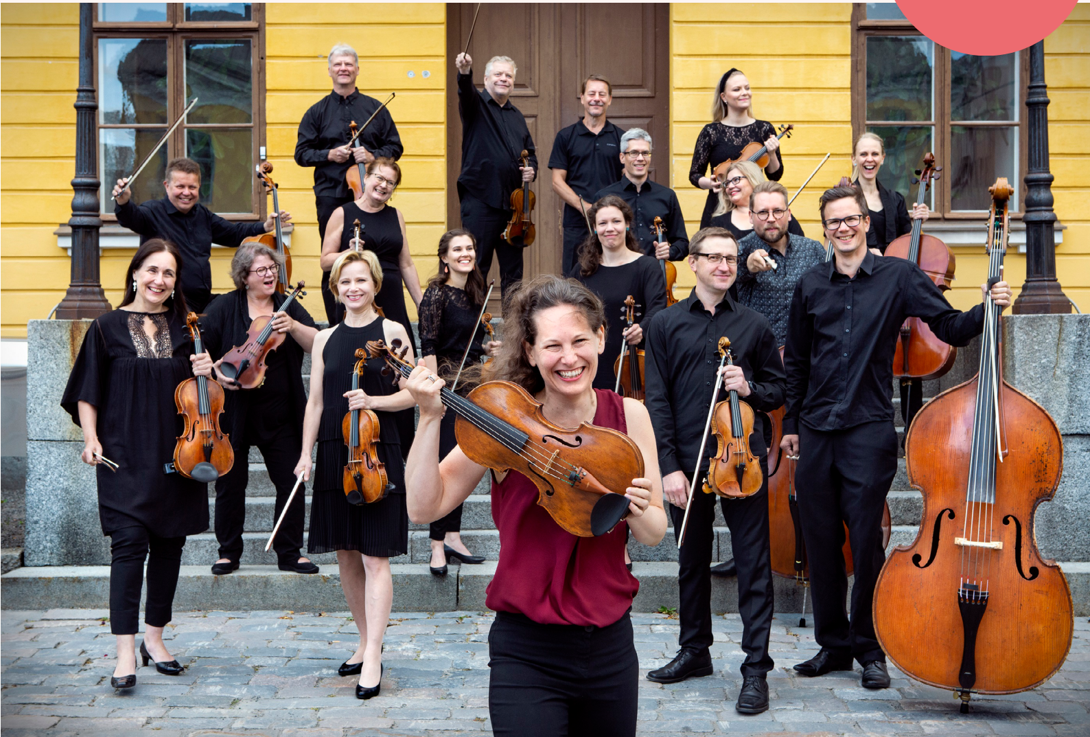
Keski-Pohjanmaan kamariorkesteri, taustalla Kokkolan raatihuone.

construction, has been a hub of Kokkola's cultural life, hosting dances, plays, and operettas.