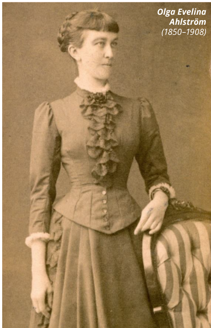
Olga Evelina Ahlström (1850–1908)